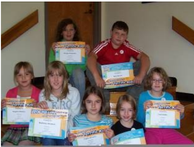
Brownville Terrific Kids September 17, 2009

The Brownville Community Church is putting on a delicious harvest meal. Please come and join us on October 30th from 5 to 6:30 p.m. at the Brownville Community Church. The menu includes beef stew, biscuits and all the fixin's--- plus an assortment of homemade pies for dessert. Yum! Yum!