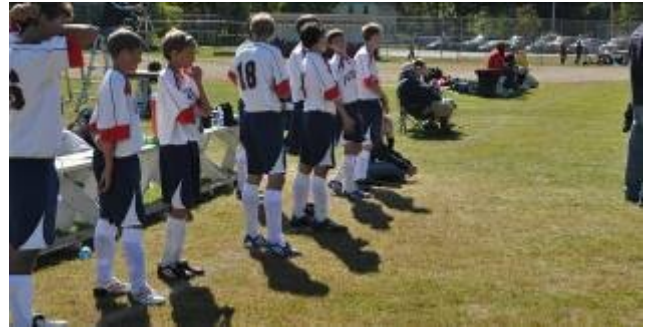
In the above photo the Penquis Boy soccer players waiting their turn, and the girls doing the same in the following!!