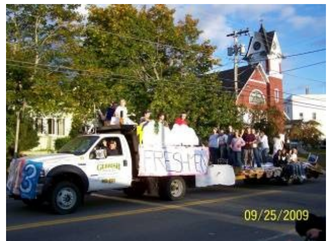
The Freshmen class float.....