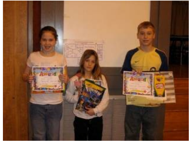
These Brownville Elementary students were winners in Read for