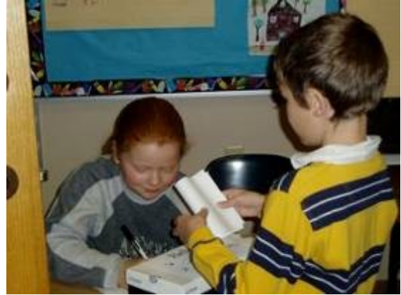
Cook School students went to the polls on election day to vote for their new school mascot. We are now the Marion C. Cook School Bull Dogs.