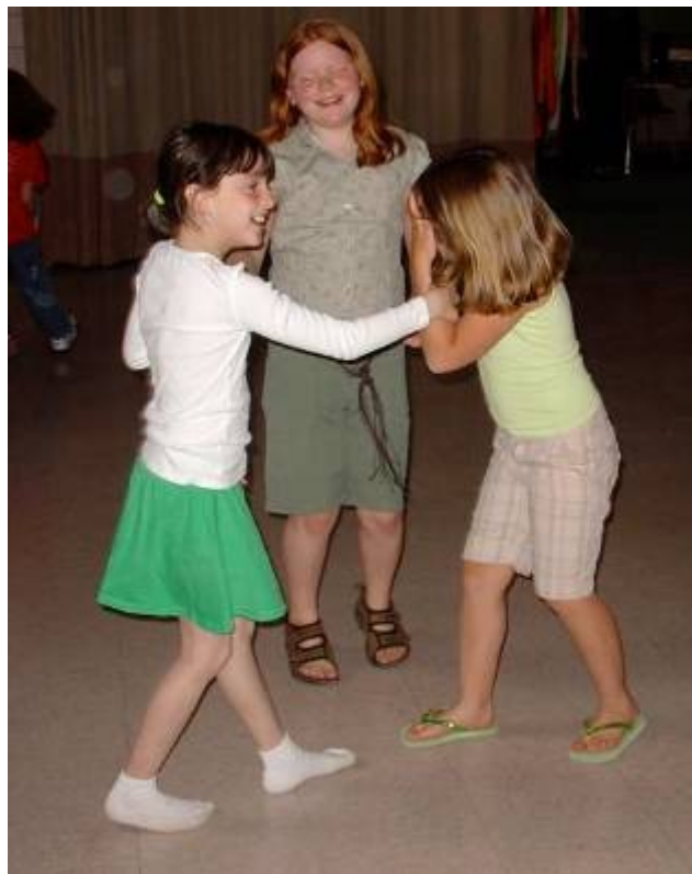
The Cook School PTO held a spring dance for the students at the Cook School. Everyone had a blast dancing the night away. The proceeds will benefit our playground fund.

Remember to clip the "Box Tops for Education" coupons and drop them off at your favorite school...each one is worth 10-cents!!