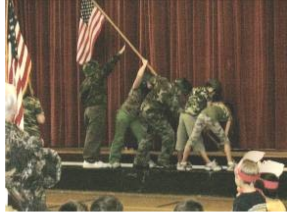
Photo 3 - Fifth grade students reenact the Iwo Jima memorial