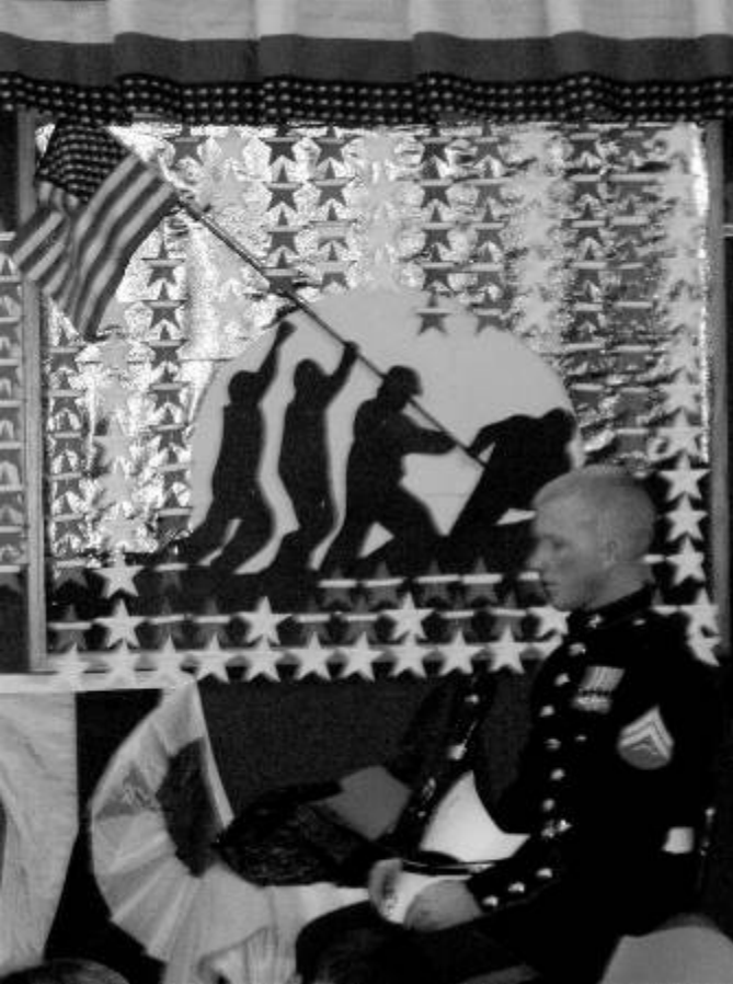
Penquis Valley High