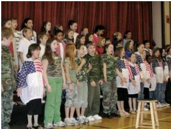
Photo 1 - 4,5,6 grade chorus sing a medley of songs at the Milo Elementary School Veterans Day assembly on Friday, November 3.