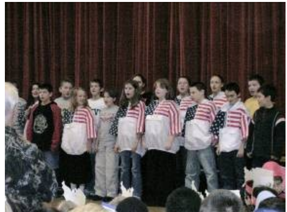
Photo 5 - First grade students show off their USA