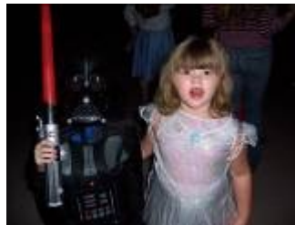
Halloween dance tonight.

Editor's Note: Here's a scary thought-I think I recognize the Macarena as the dance in the above photo!!