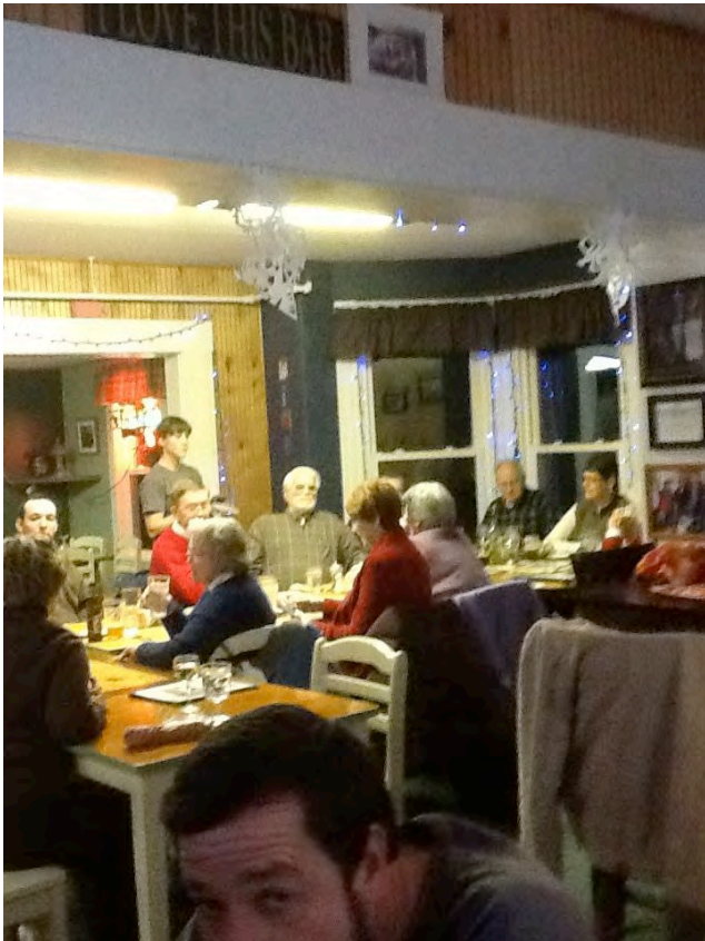
Can anyone name the guy peeking over the bottom of the picture???