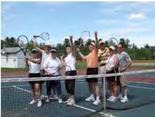
The Competitors: From Left to Right:

Open to all -- tournaments are planned for July 9 th - ladies' doubles, July 10 th - men's doubles and August 21 st - mixed doubles. Tournaments are free - just bring a new can of tennis balls. Don't forget FUN tennis every Tuesday from 4:30 to 6:30PM and Sunday from 2 to 4PM - No cost and no sign up - just show up - everyone will play. Contact Mary Lou at 943 3267 for information or to sign up for the contests.