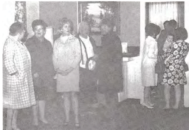
On Sunday afternoon interested citizens toured the new Merrill Bank building and enjoyed catered refreshments.

The Merrill Trust Company provided an "open house" last Sunday to introduce their new Milo office building. All day Saturday trucks and bucket loaders travelled back and forth between the old offices and the new building, on opposite sides of Main street; transferring office equipment, files, and valuables.