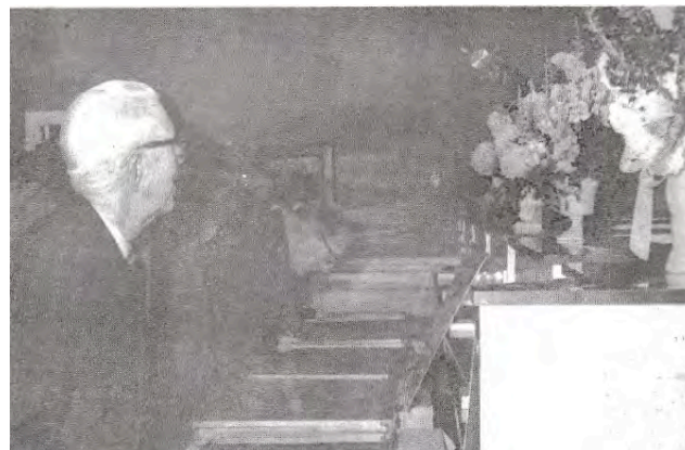
An interesting display of currency, including many old bills, drew attention.