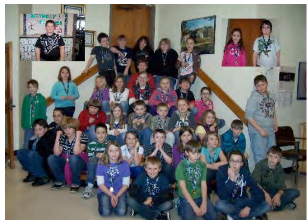
Brownville Elementary recognized all of the students in grades 3-5 who were Proficient in one or more areas on the state NECAP test last October. The academic areas were reading, math and writing. We are very proud of your accomplishment and hard work.